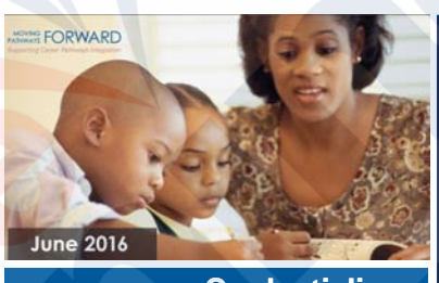
Credentialing, Apprenticeship and College Courses